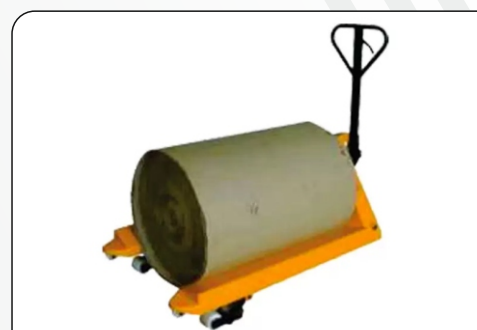
Paper Roll Lifting with Hand Pallet Truck