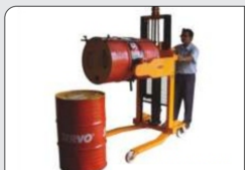
LIQUID FROM ONE DRUM TO OTHER