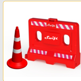
Road Safety Products