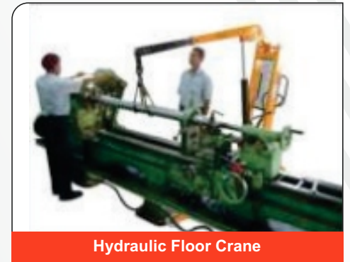
Hydraulic Floor Crane