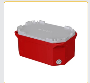
Insulated Ice Box