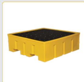
Drum Spill Containment Pallets