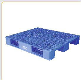
Injection Molded Plastic Pallets