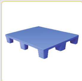
Hygienic Plastic Pallets