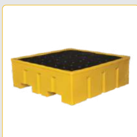
Drum Spill Containment Pallets