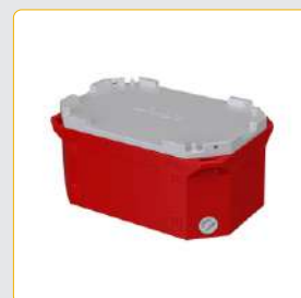
Insulated Ice Box