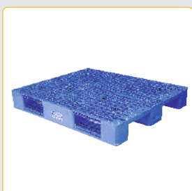
Injection Molded Plastic Pallets