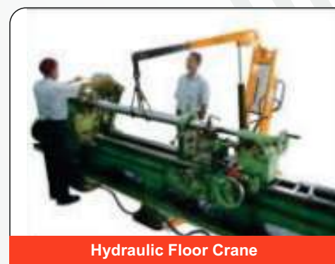
Hydraulic Floor Crane