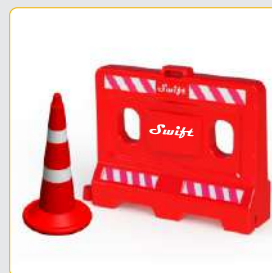
Road Safety Products