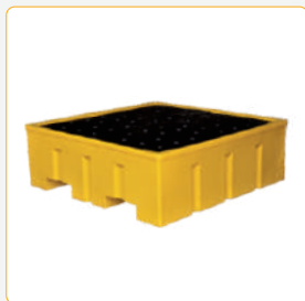
Drum Spill Containment Pallets