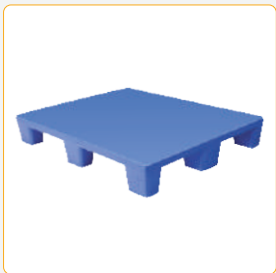
Hygienic Plastic Pallets