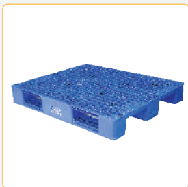
Injection Molded Plastic Pallets