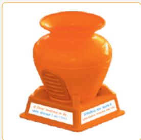
Nirmalya Kumbh Kalash