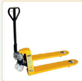
Material Handling Equipment